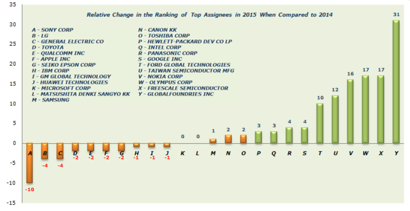
Figure 1: Relative change in the ranking of top 25 assignees of 2015 when compared to 2014

The top 25 list is majorly dominated by Asian countries compared to US or European countries. It certainly doesn't mean that US companies have lost their vigor for patents; rather Asian companies have apparently made it a higher priority.